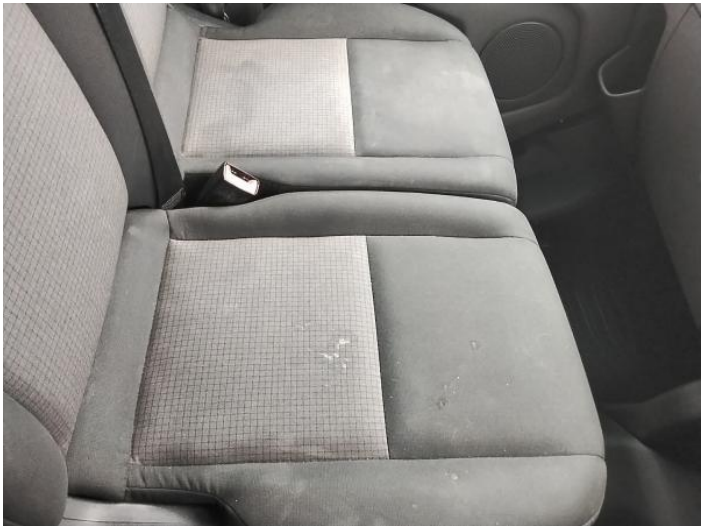
2: Seat Base Cover nsf Soiled Heavy