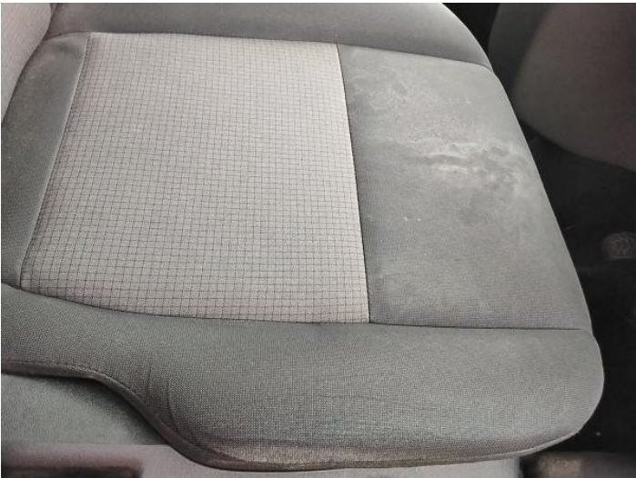
1: Seat Base Cover osf Soiled Heavy