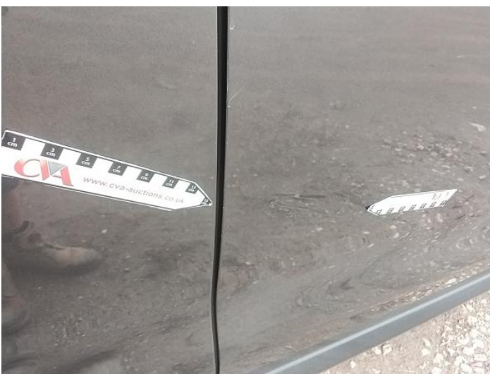
7: Door osf Scratched Over 25mm Thru Paint