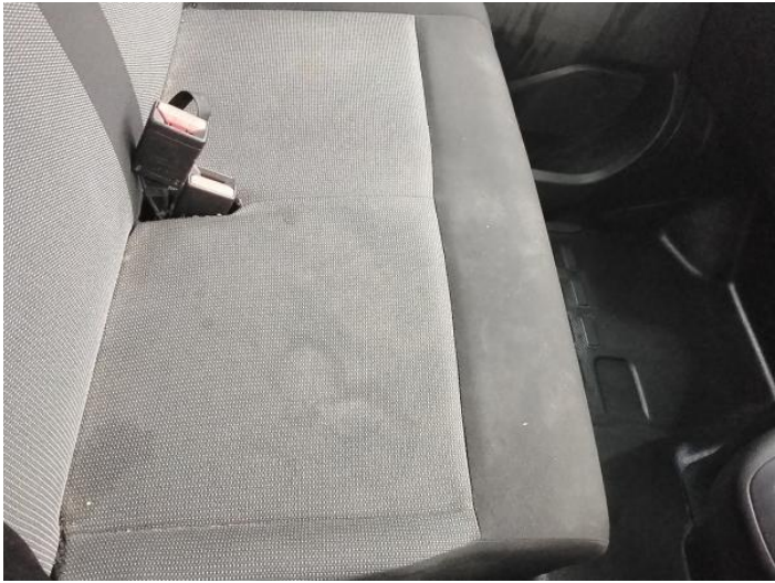
10: Seat Base Cover nsf Soiled Heavy