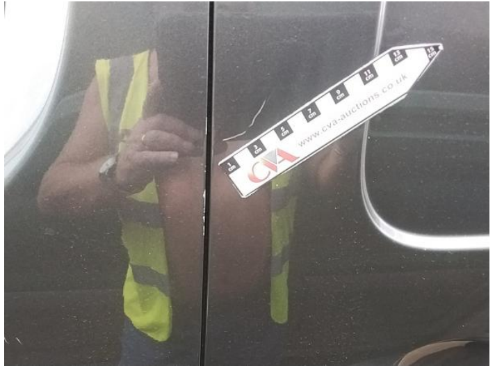
4: Qtr Panel nsr Scratched Over 25mm Thru Paint