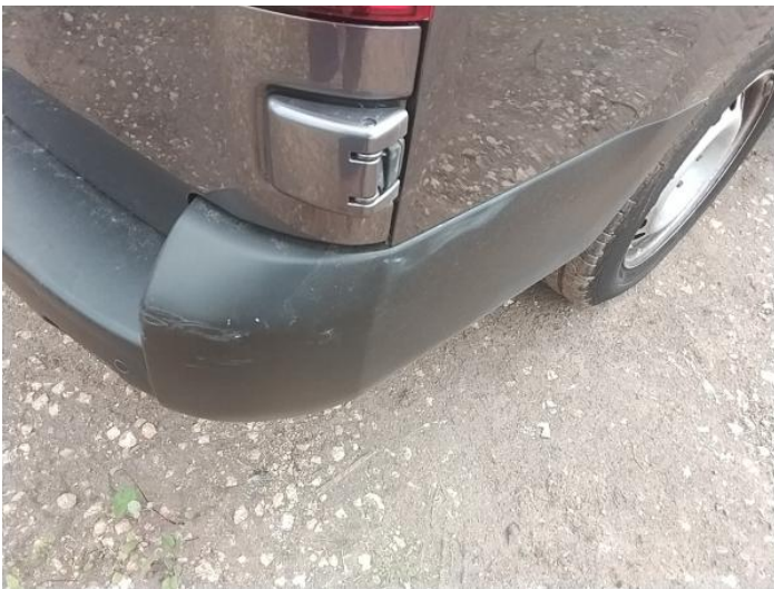
5: Bumper Rear Moulding Scuffed (Unpainted) Over 100mm