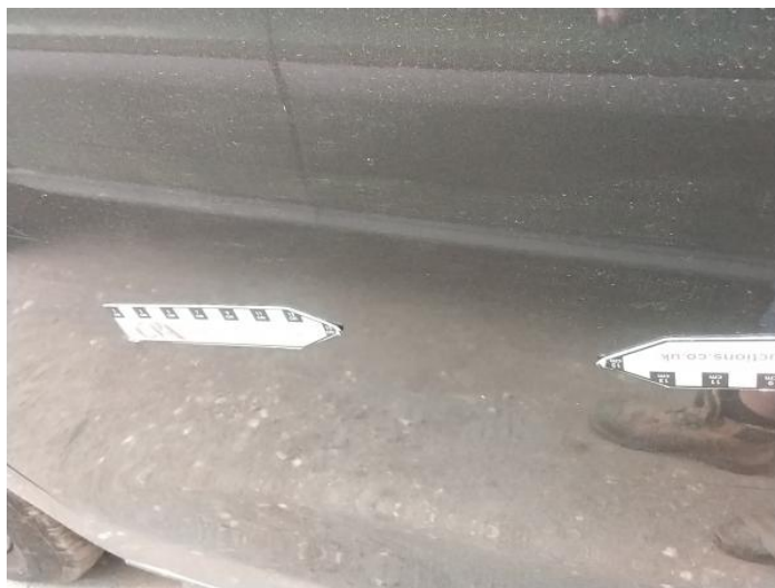
2: Door nsf Scratched Over 25mm Not Thru Paint