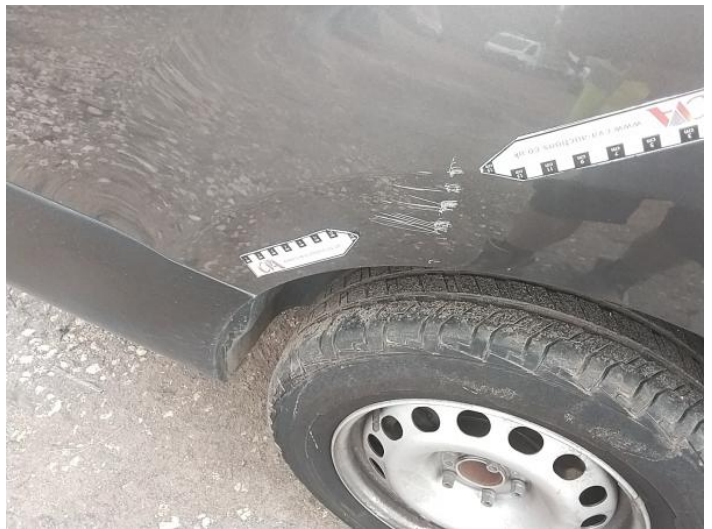
6: Qtr Panel osr Scratched Over 25mm Thru Paint