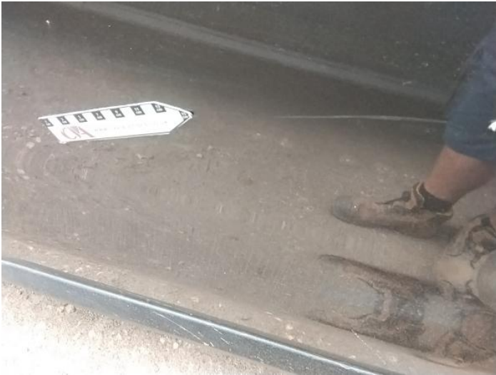
3: Door nsf Scratched Over 25mm Not Thru Paint