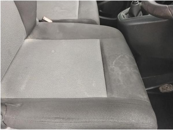
9: Seat Base Cover osf Soiled Heavy