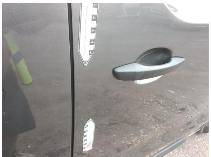
8: Door osf Dented Over 30mm