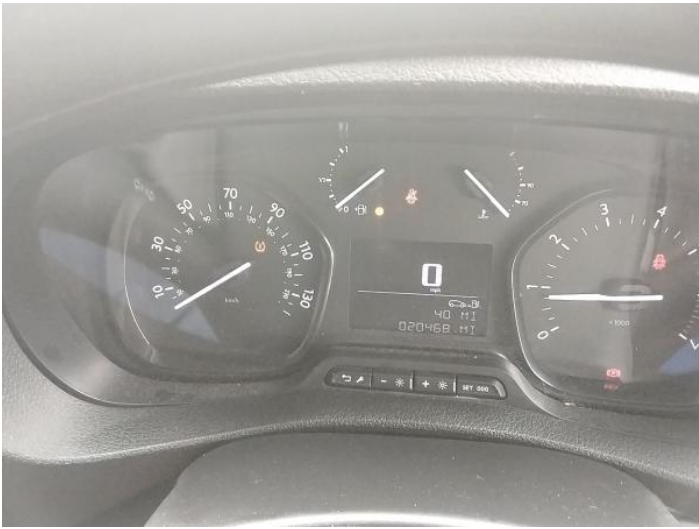
11: Dash Warning Lights Displayed No Action