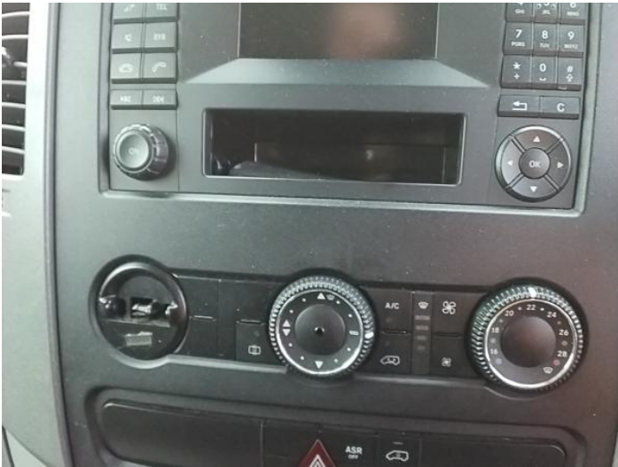
5: Switches And Controls Broken Replace