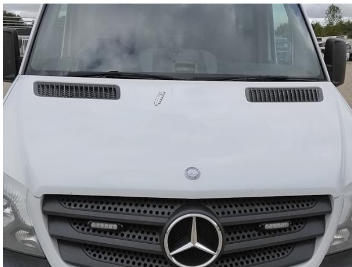
2: Bonnet Chipped Multiple Chips