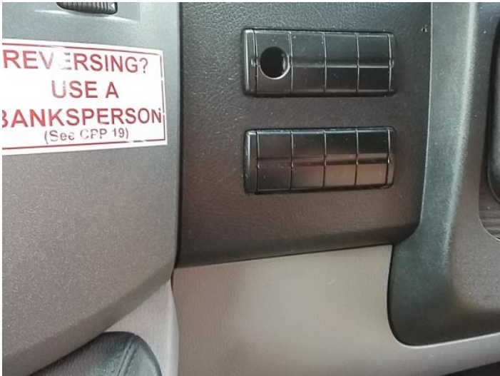
6: Other M