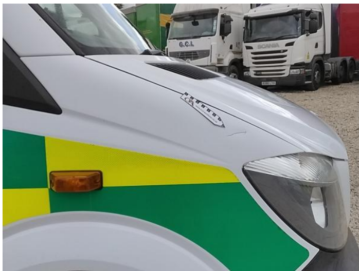
1: Wing of Scratched Over 25mm Thru Paint