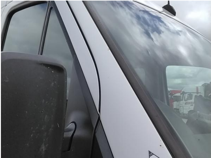
4: A Post os Chipped Multiple Chips