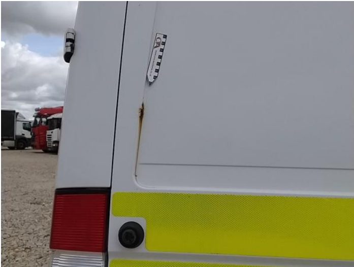
3: Qtr Panel osr Rusted Over 5mm