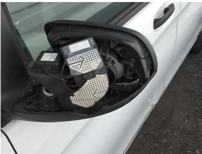
13: Door Mirror Assy osf Broken Replace