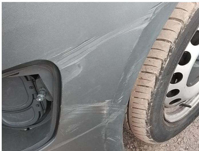
2: Bumper Front Moulding Scuffed (Unpainted) Over 100mm