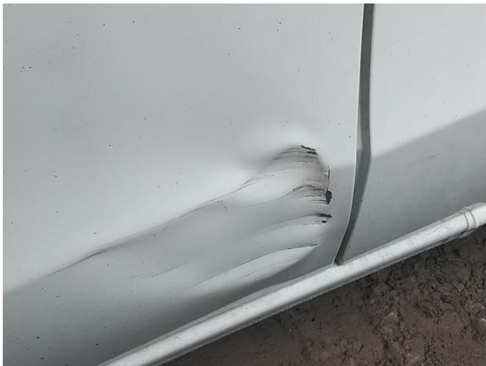
3: Door osf Dented With Paint Damage