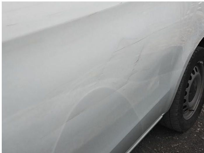
4: Panel Rear Scratched Over 25mm Thru Paint