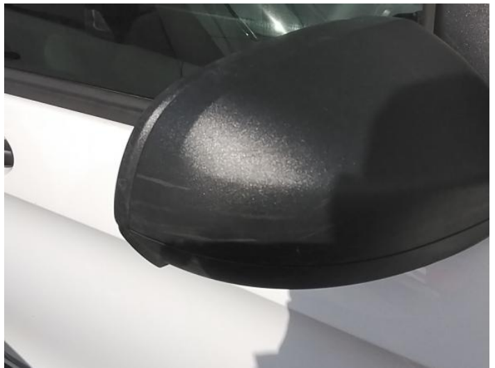
12: Door Mirror Assy nsf Scuffed (Unpainted) Over 100mm