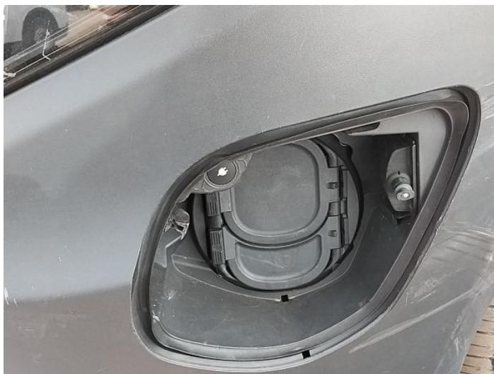
1: Bumper Front Missing Replace