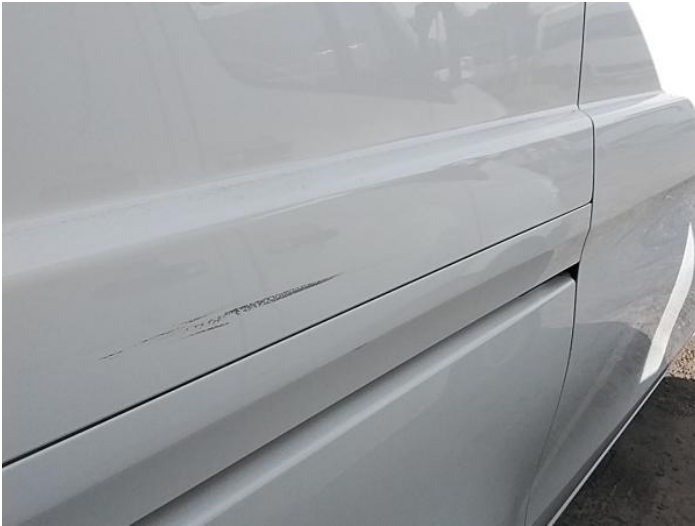
9: Panel Rear Scratched Over 25mm Thru Paint