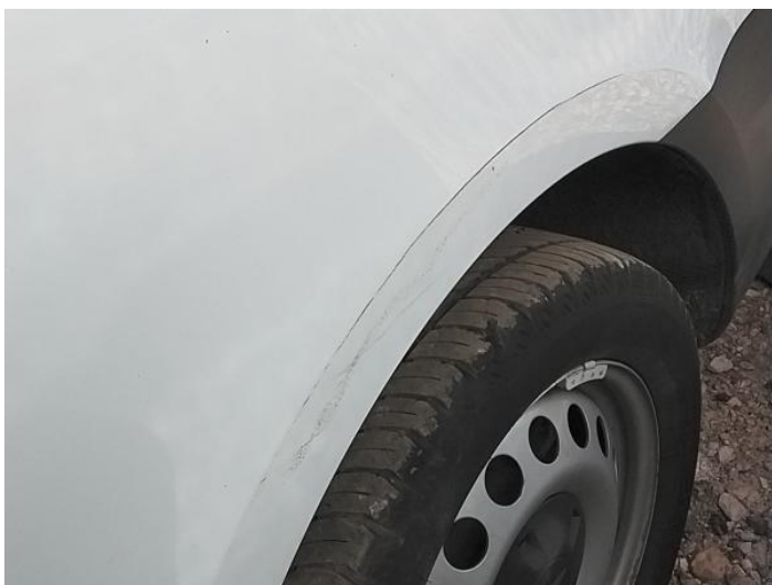
5: Qtr Panel osr Scratched Over 25mm Thru Paint