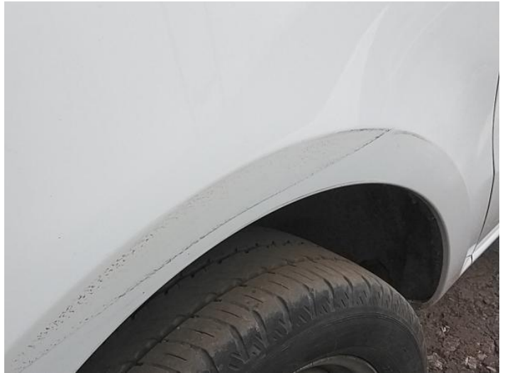
10: Qtr Panel nsr Scratched Over 25mm Thru Paint