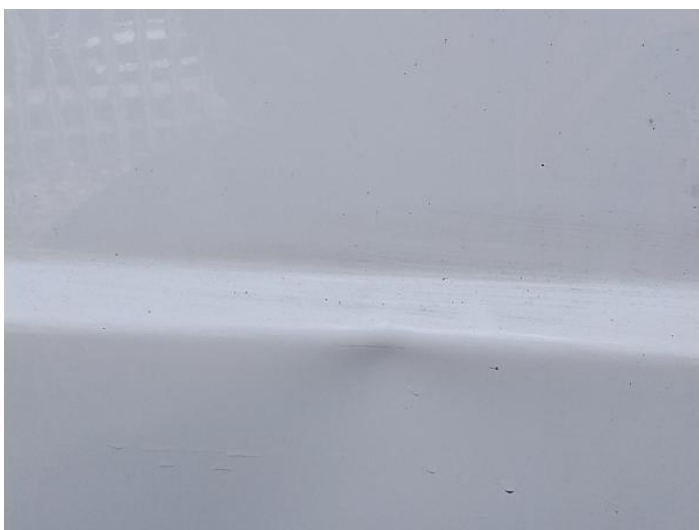
7: Door nsr Dented Over 30mm