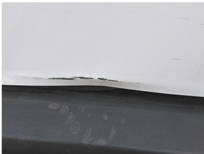
6: Door nsr Dented With Paint Damage