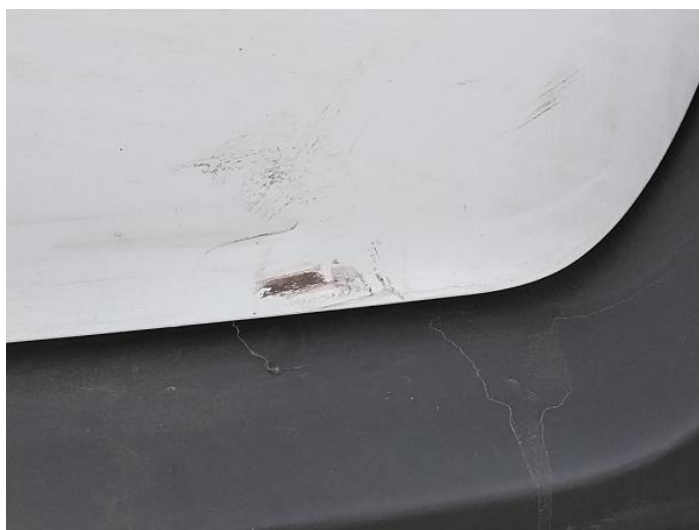
8: Door nsr Scratched Over 25mm Thru Paint