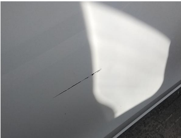
11: Panel Front Scratched Over 25mm Thru Paint