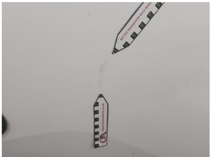
8: Door osf Scratched Over 25mm Thru Paint