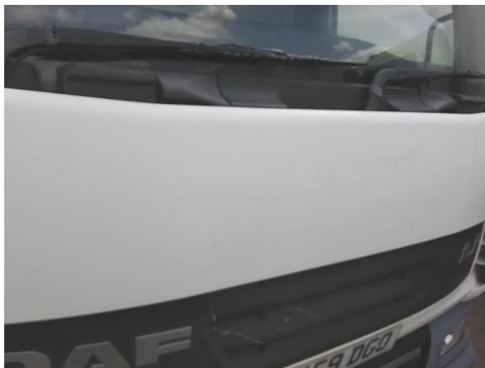
2: Bonnet Chipped Multiple Chips