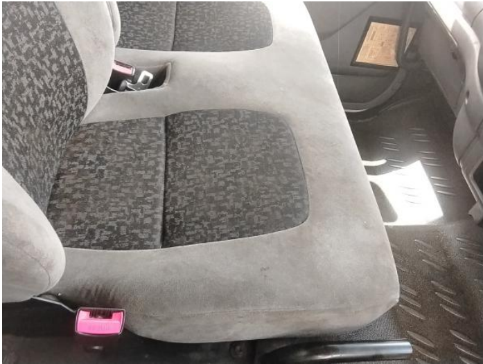
10: Seat Base Cover nsf Soiled Heavy