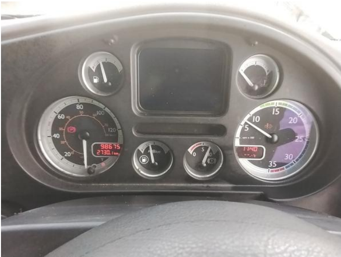
11: Dash Warning Lights Displayed No Action