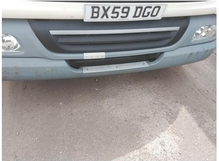
4: Bumper Front Rusted Over 5mm