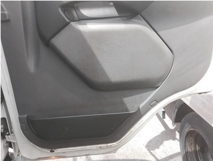
9: Door Pad osf Soiled Heavy