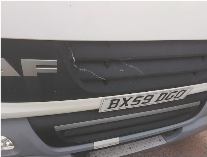
3: Bumper Front Grill Broken Replace