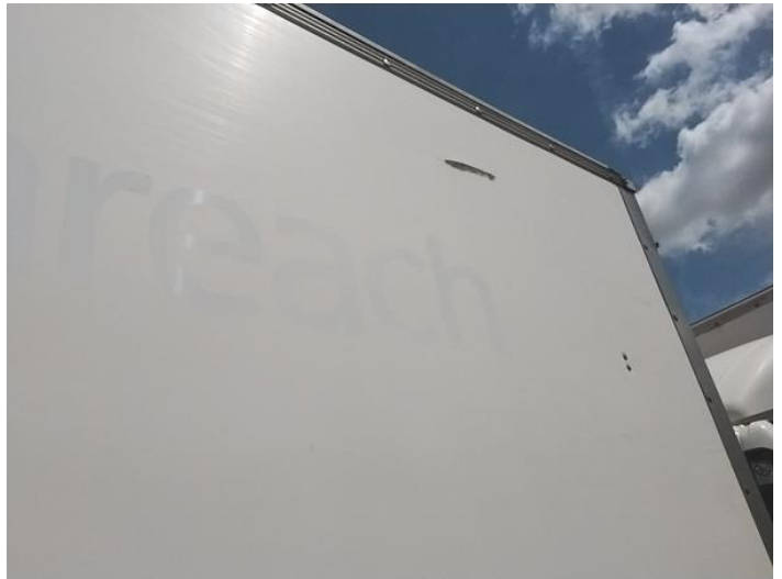
6: Qtr Panel nsr Scratched Over 25mm Thru Paint