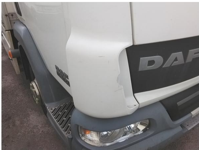
1: Panel Front Cracked Replace