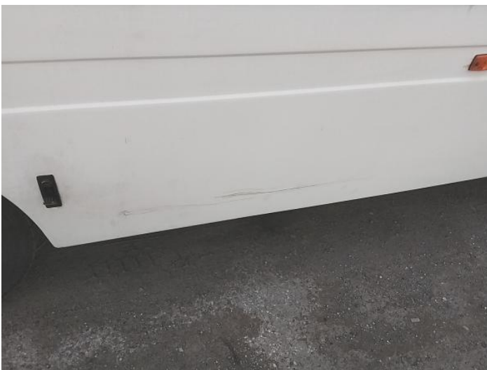
7: Qtr Panel Moulding os Broken Replace