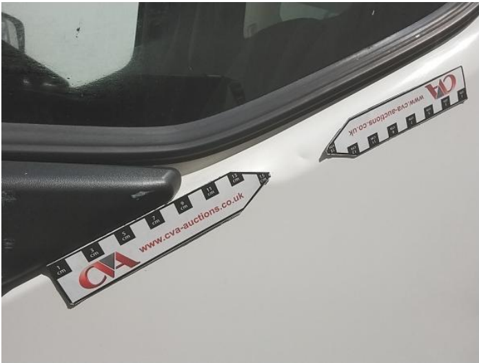
5: Door nsf Dented Over 30mm