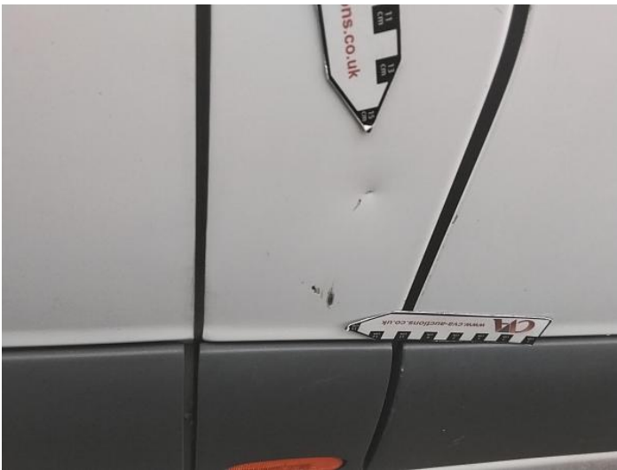
29: C Post os Dented With Paint Damage