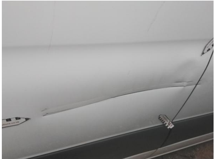
28: Qtr Panel osr Dented With Paint Damage