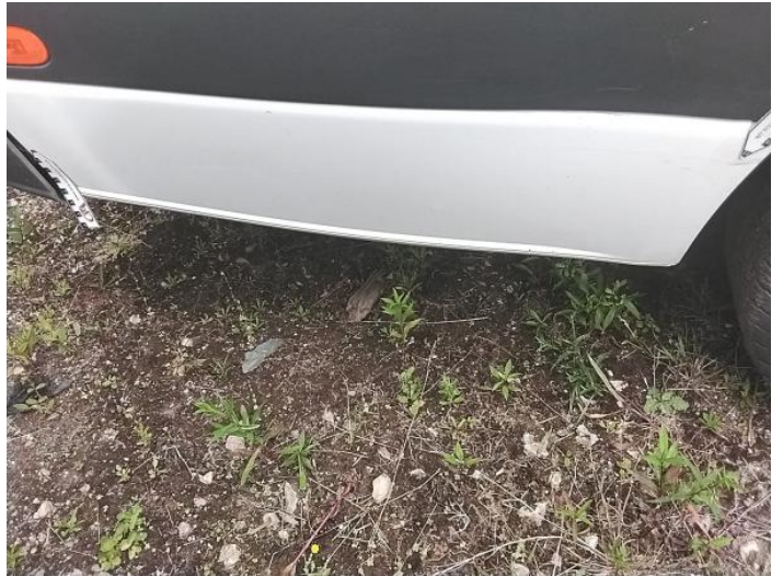
22: Qtr Panel osr Scratched Over 25mm Thru Paint