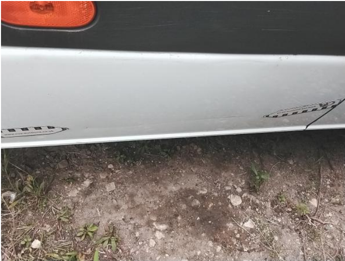
27: Qtr Panel osr Dented With Paint Damage