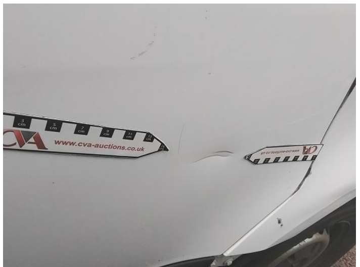
32: Door osf Dented With Paint Damage