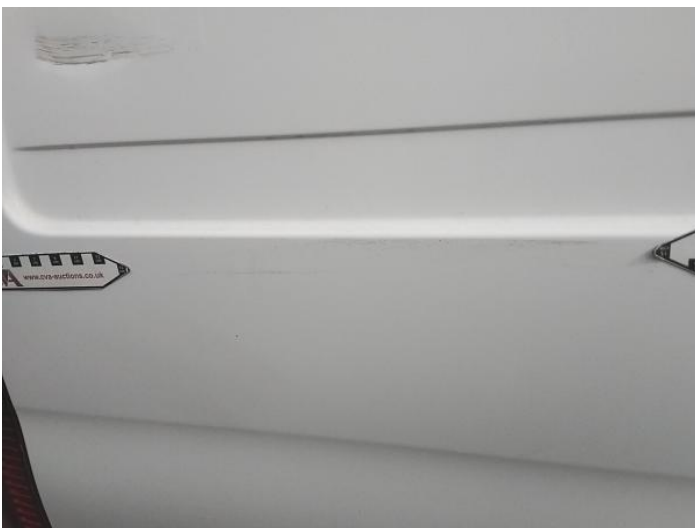
19: Qtr Panel osr Scratched Over 25mm Thru Paint