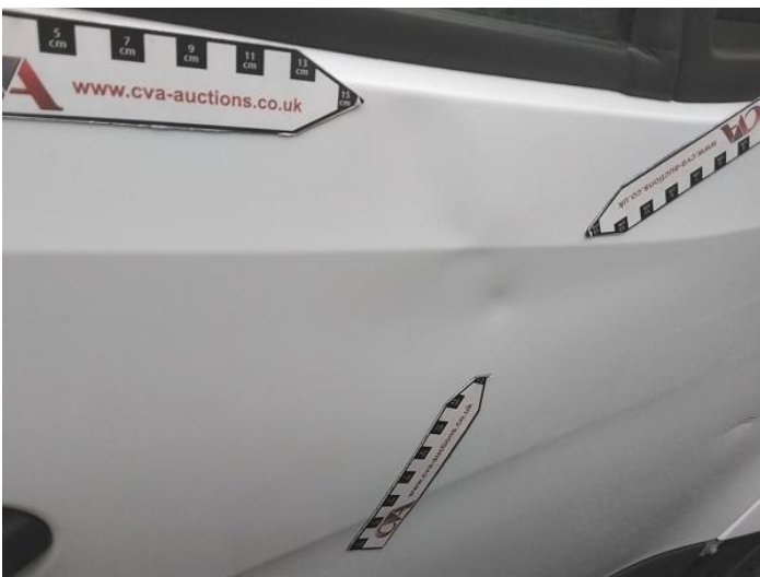
31: Door osf Dented Over 30mm