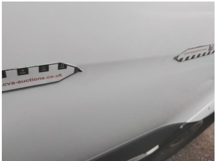
30: Door osf Dented Over 30mm