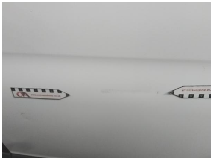
20: Qtr Panel osr Dented With Paint Damage