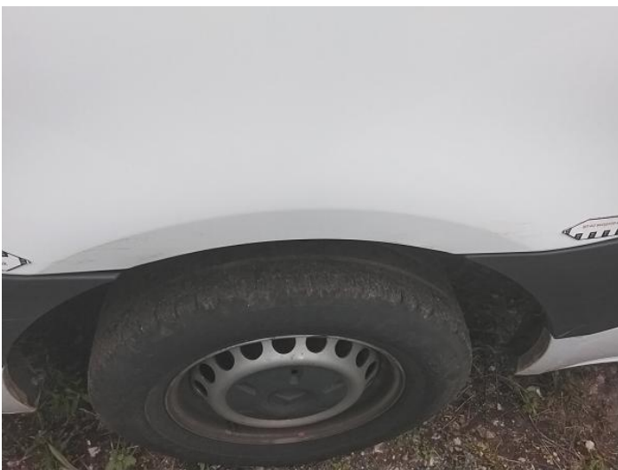
25: Qtr Panel osr Scratched Over 25mm Thru Paint