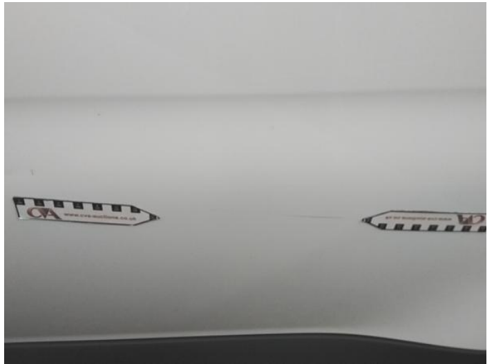
24: Qtr Panel osr Scratched Over 25mm Thru Paint