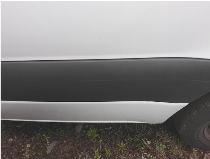
23: Qtr Panel Moulding os Scuffed (Unpainted) Over 100mm