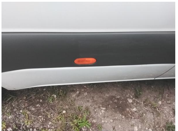
26: Qtr Panel Moulding os Scuffed (Unpainted) Over 100mm