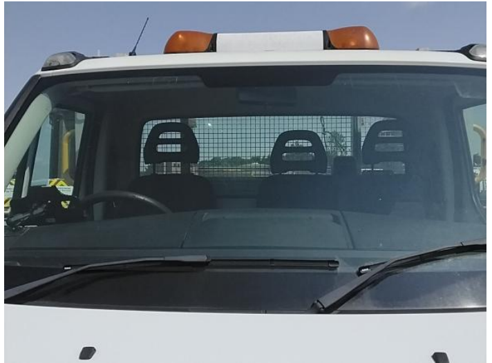
4: Screen Front Chipped UpTo 10mm