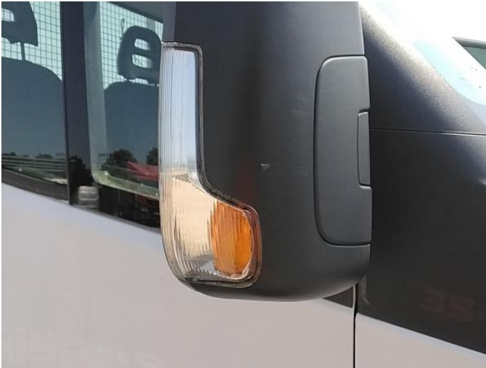
9: Door Mirror Assy osf Scuffed (Unpainted) UpTo 100mm