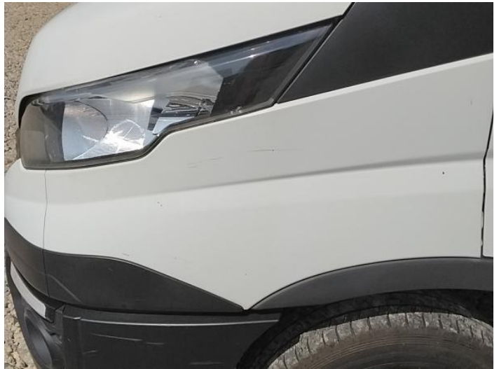
6: Wing nsf Scratched Over 25mm Thru Paint