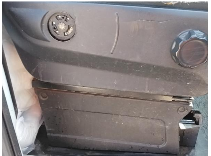
12: Other N/A N/A