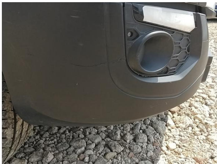
2: Bumper Front Moulding Scuffed (Unpainted) Up To 100mm