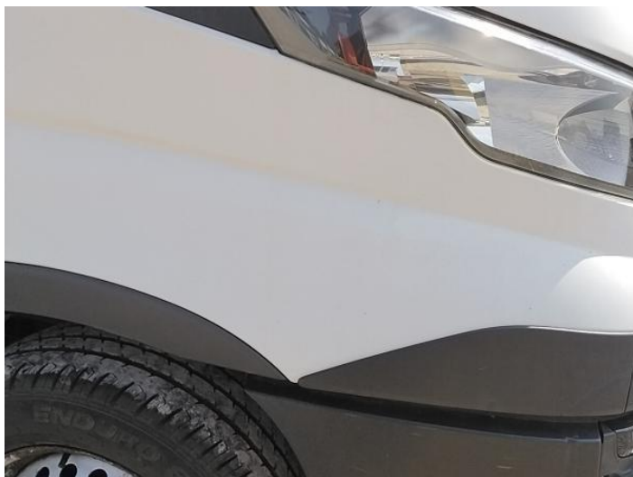
1: Wing of Chipped Multiple Chips