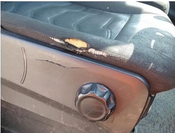
11: Seat Base Cover osf Torn Over 3mm