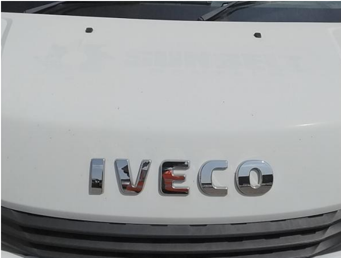
3: Bonnet Chipped Multiple Chips