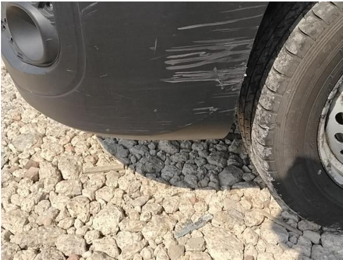
5: Bumper Front Moulding Scuffed (Unpainted) UpTo 100mm