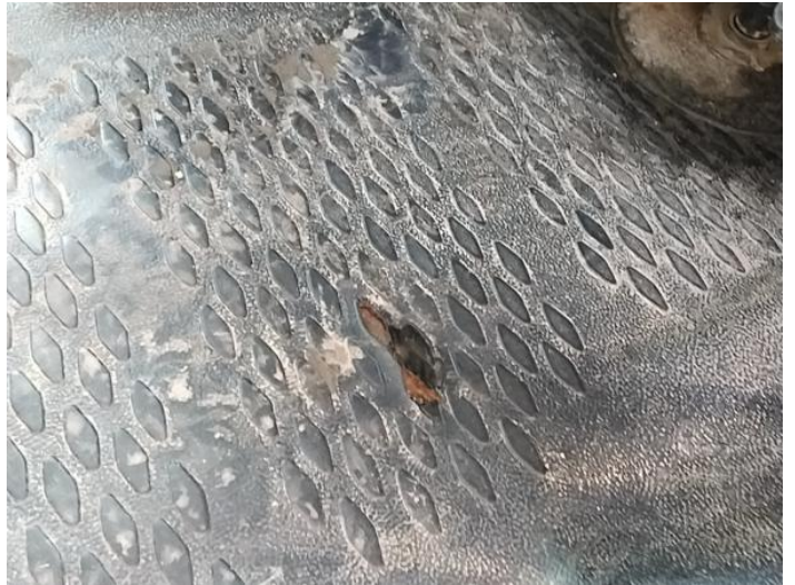
10: Carpets Front Holed Over 3mm