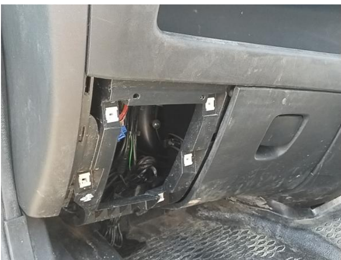
13: Other N/A N/A