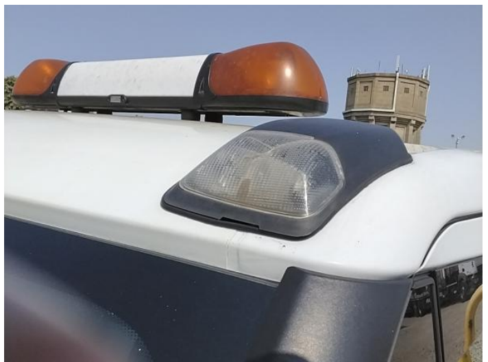
8: Other N/A N/A