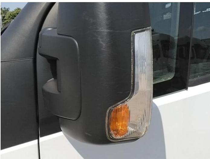
7: Door Mirror Assy nsf Scuffed (Unpainted) UpTo 100mm