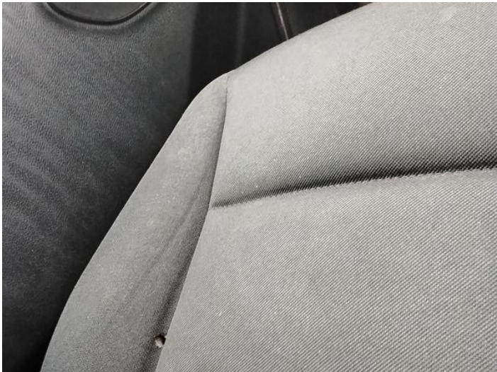
2: Seat Base Cover nsf Burn Over 3mm