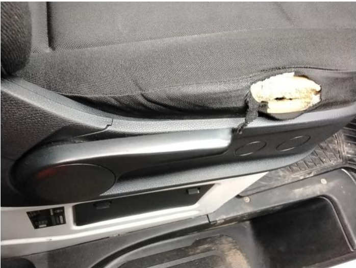
1: Seat Base Cover osf Torn Over 3mm