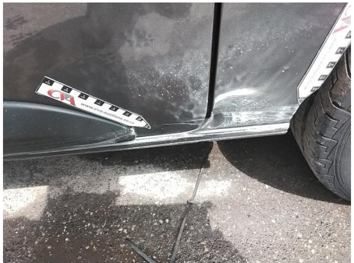
4: Qtr Panel nsr Dented With Paint Damage