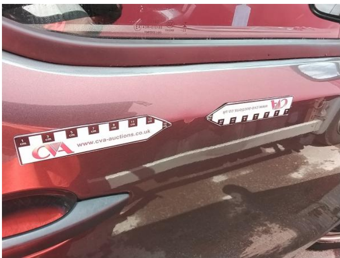
5: Door osf Dented Over 30mm