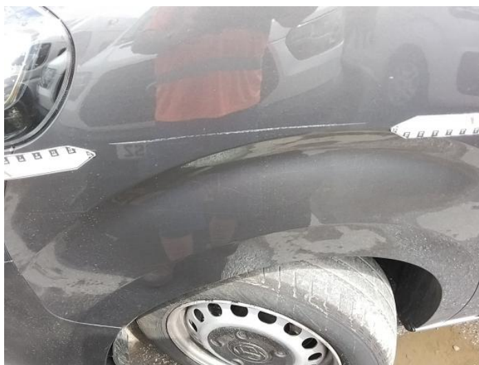
2: Wing nsf Scratched Over 25mm Thru Paint