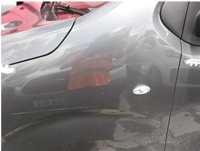
3: Wing nsf Scratched Over 25mm Thru Paint