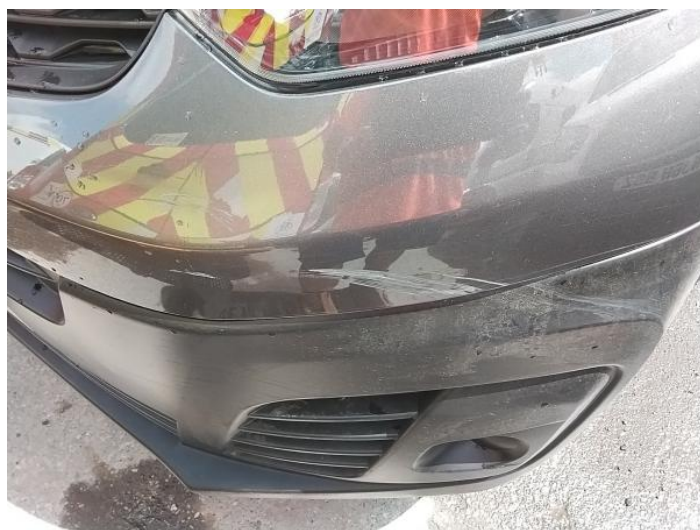
1: Panel Front Scratched Over 25mm Thru Paint