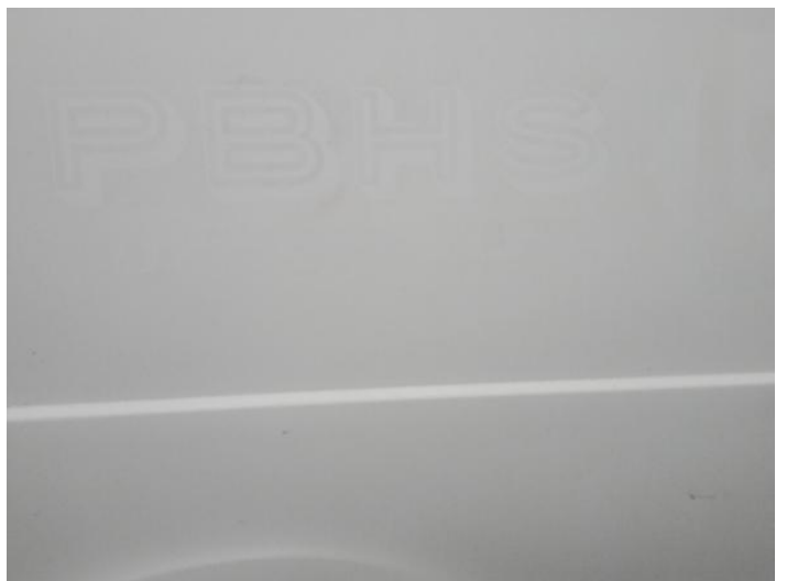
8: Qtr Panel osr Chipped Multiple Chips