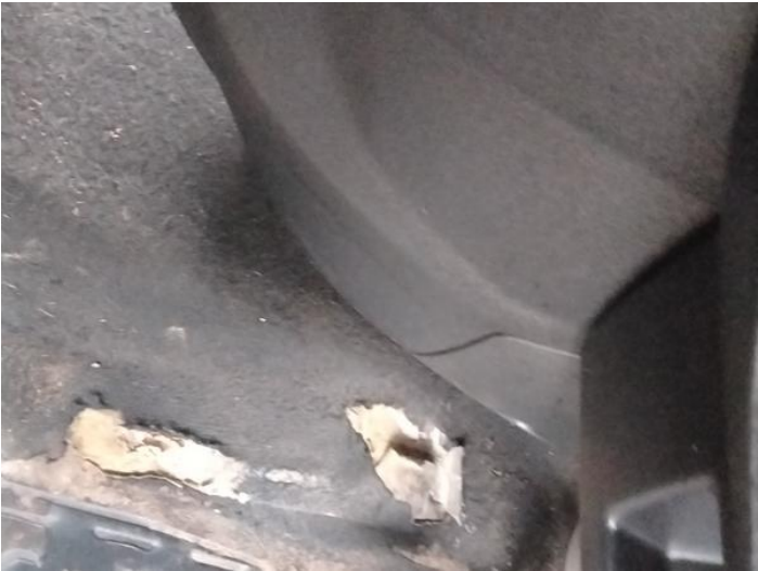
16: Carpets Front Torn Over 10mm