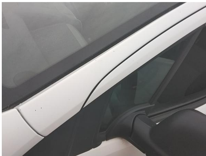
2: A Post ns Chipped Multiple Chips