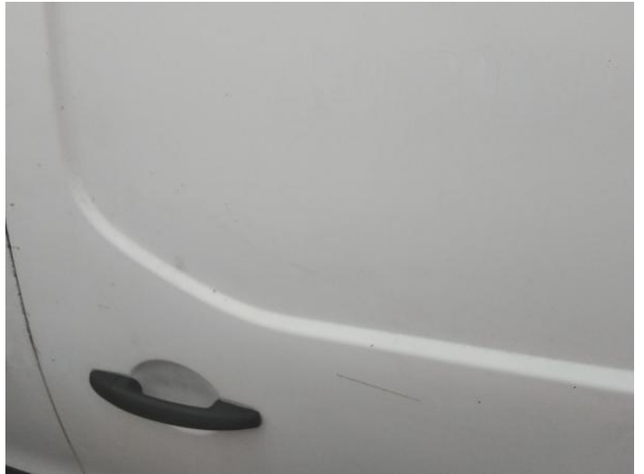
4: Qtr Panel nsr Chipped Multiple Chips