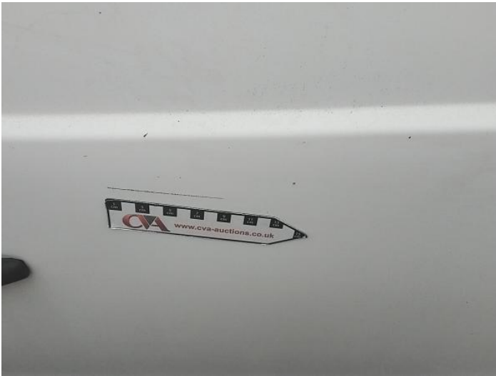
5: Qtr Panel nsr Scratched Over 25mm Thru Paint