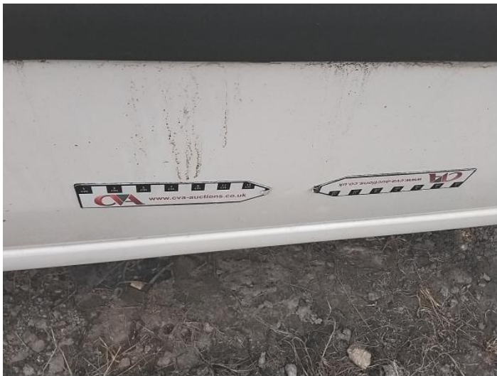
11: Door osf Dented Over 30mm