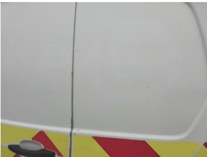
7: Door osr Chipped Multiple Chips