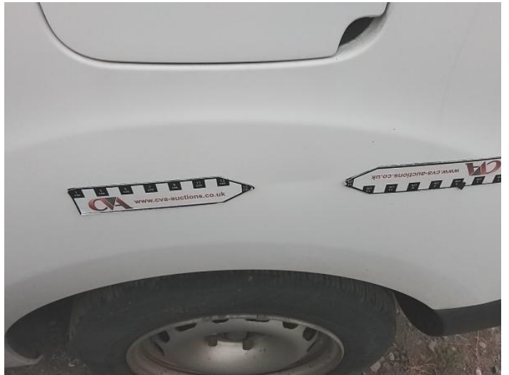
6: Qtr Panel nsr Dented Over 30mm