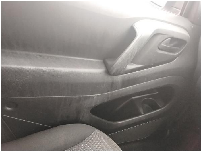
15: Door Pad nsf Soiled Heavy