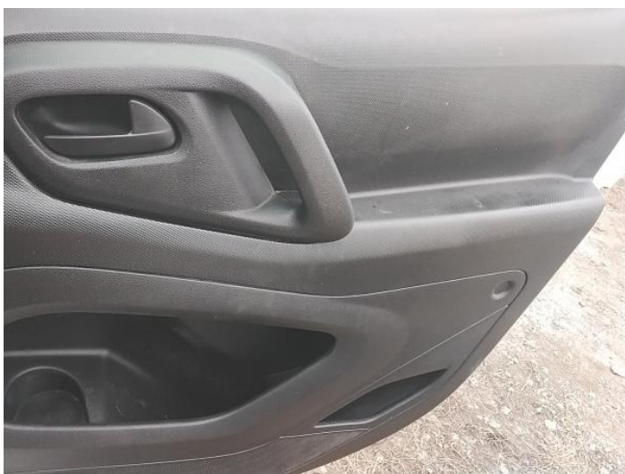
13: Door Pad osf Soiled Heavy