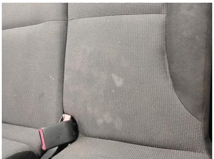
14: Seat Base Cover nsf Soiled Heavy