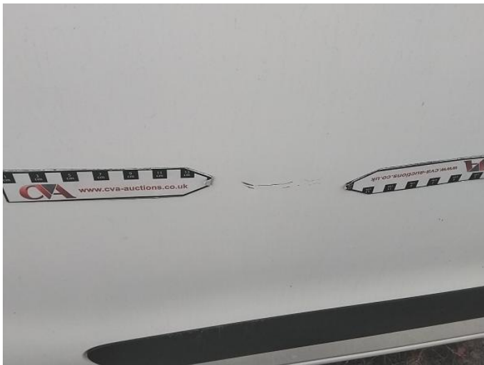
9: Qtr Panel osr Scratched Over 25mm Thru Paint