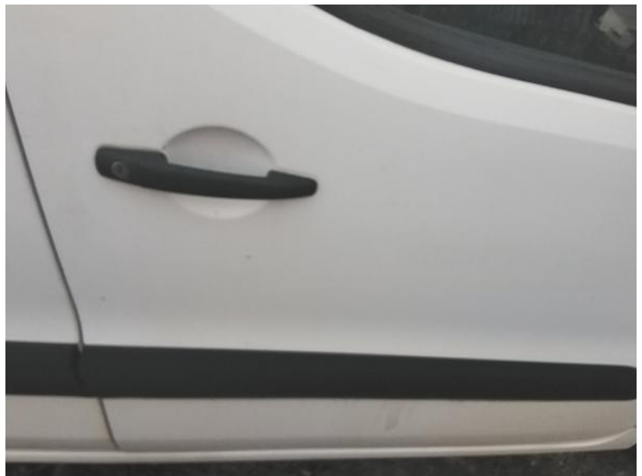
10: Door osf Chipped Multiple Chips