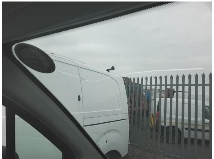
12: Screen Front Cracked Replace