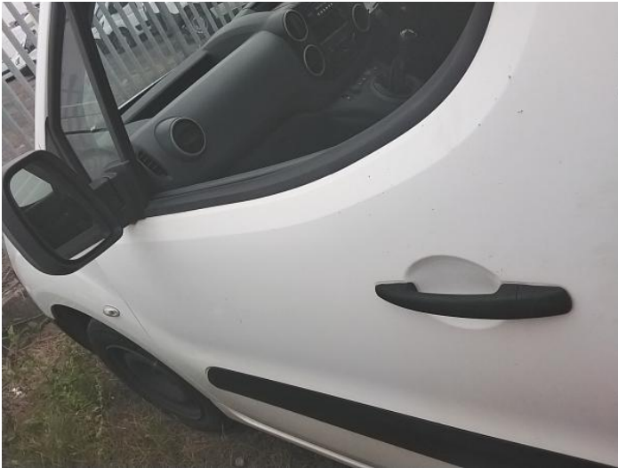
3: Door nsf Chipped Multiple Chips