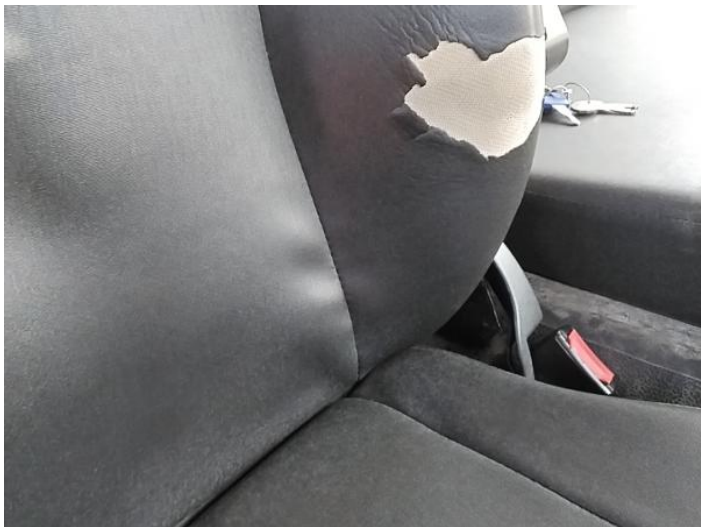
15: Seat Back Cover osf Torn Over 3mm