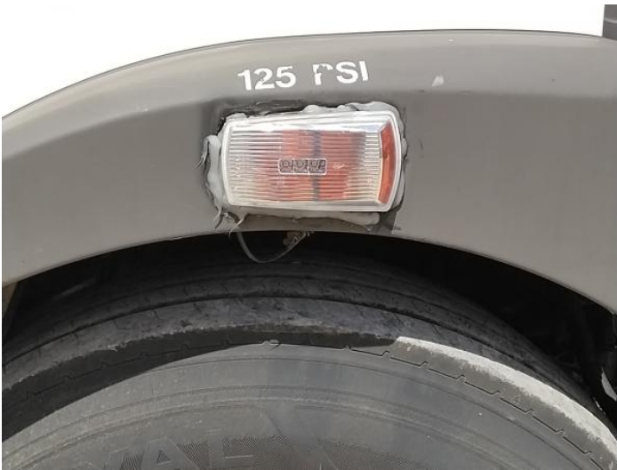
9: Flasher Side Repeater ns Broken Replace